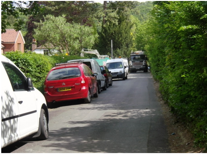
May 2011 No 8 Welcomes. GML promised not to park on our road during construction!!